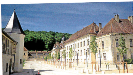
ABOVE: The Cistercian abbey of Clairvaux

52230 Poissons Tel: (Fr) 3 25 06 85 92 le-st-amand.com B&B, doubles from €55.