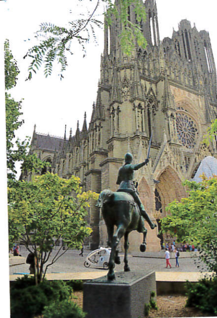
ABOVE: Joan's statue outside Reims Cathedral

"In the firmament of history, Joan of Arc is a massive star," writes Helen Castor. To this new convert, she is an inspiring motivation for a richly beautiful hike in the lands that she saw through determined eyes. 👉