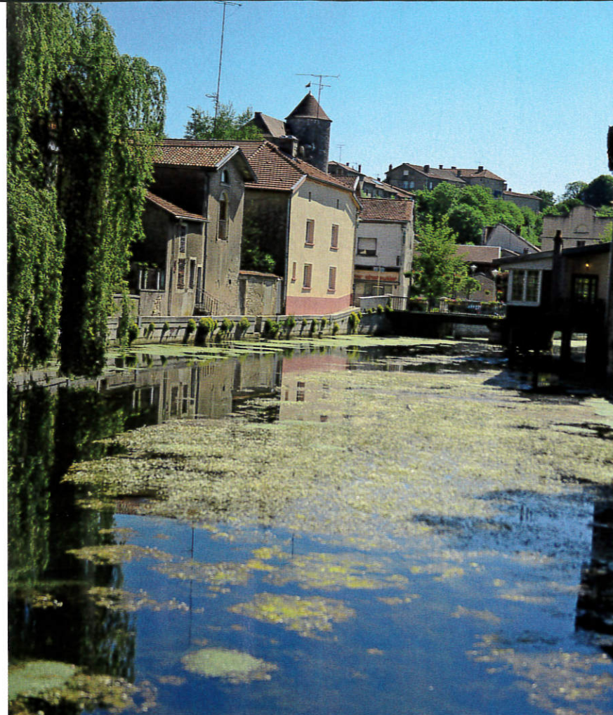
ABOVE: The village of Gondrecourt-le-Château beside the River Ornain; LEFT: The Sentier Jeanne d'Arc

Thereafter, the primal Forêt Domaine de Vau enveloped me en route to Gondrecourt-le-Château. The woodland paths were alive with harebells and lady orchids, so rare in Britain; multicoloured swallowtail butterflies rivalled the stained-glass vivacity of Vaucouleurs' church, while two feuding pine martens scarcely noticed me. It set the tone for a week celebrating nature. On other days, I would send startled hares racing across fields and see numerous foxes and deer. My 30-kilometre trek on the first day saw me following languid small rivers as